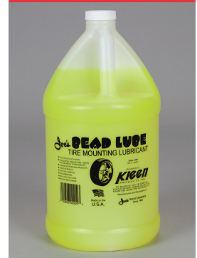
209-Joe's Bead Lube