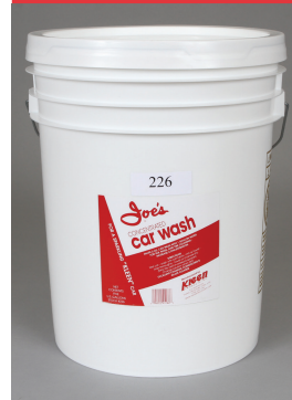
226-Joe's Concentrated Car Wash