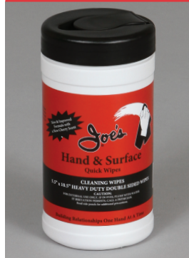
704KW-S-Joe's Hand & Surface Quick Wipes