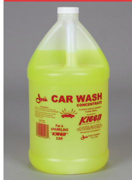
206-Joe's Concentrated Car Wash