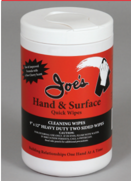
704KW-Joe's Hand & Surface Quick Wipes