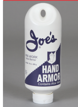
805HA-Joe's Hand Armor