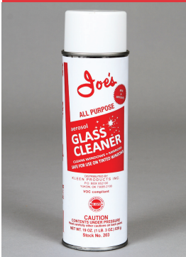
203-Joe's Glass Cleaner