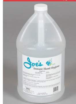
600HS-Joe's Instant Hand Hygiene