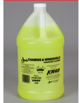
201-Joe's Chamois Cleaner